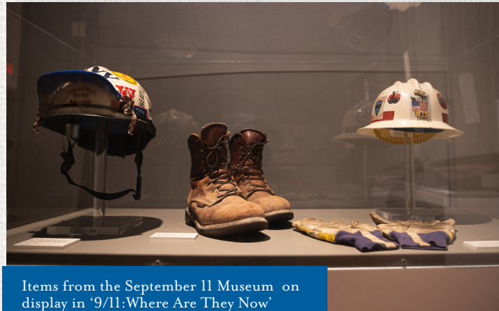
Items from the September 11 Museum on display in '9/11: Where Are They Now'