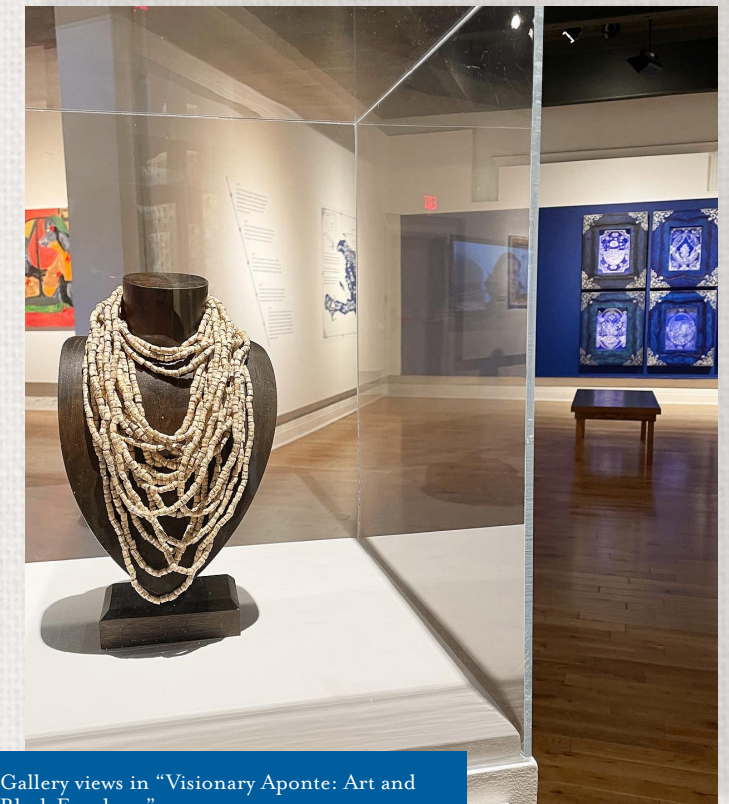
Gallery views in "Visionary Aponte: Art and Black Freedom."

This exhibit showcased examples of nineteenth and twentieth century masks and bronze sculptures that originated from midcontinent Africa.