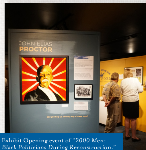
Exhibit Opening event of "2000 Men: Black Politicians During Reconstruction."

This exhibit looks at a day in the life of a Regency-era Pensacolian through fashion and garment use.